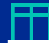
Windows, doors, and facades

➤ Haven't found your industry? Ask us. For more inspiration, browse through the following solution stories.