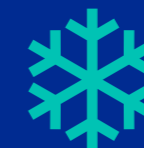
Ventilation and air conditioning